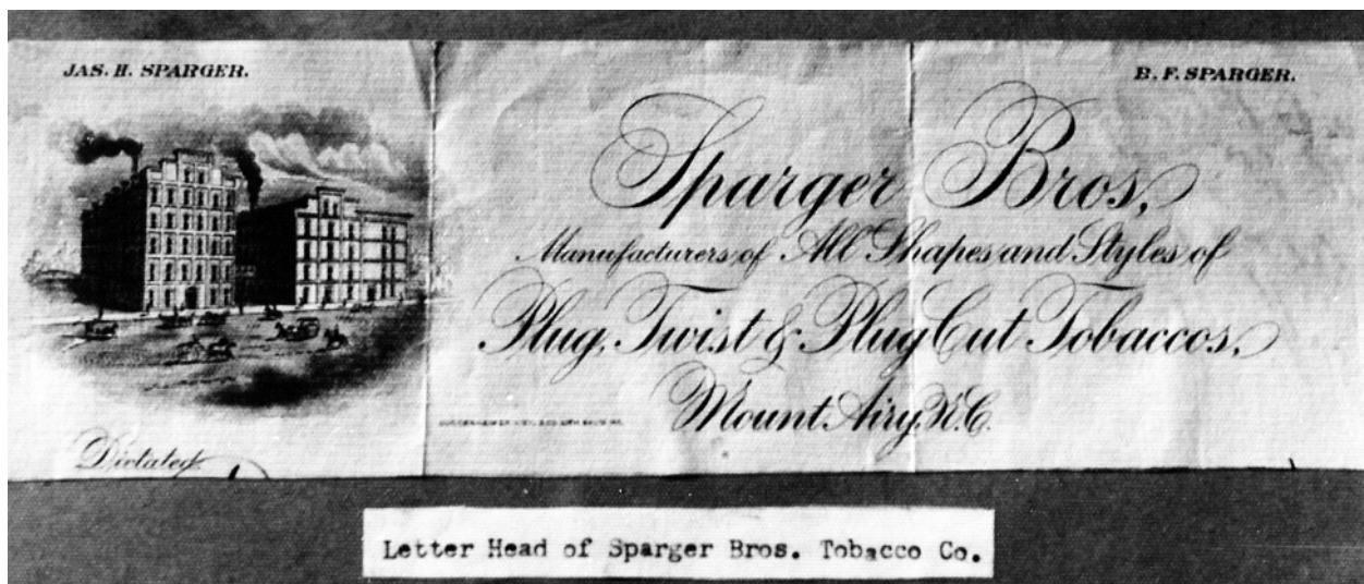
Letter Head of Sparger Bros. Tobacco Co.