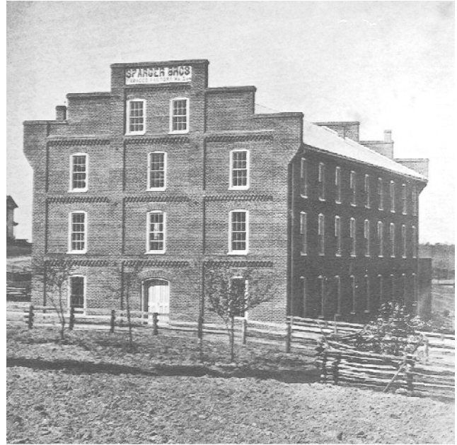
Sparger Brothers tobacco warehouse, Mount Airy, NC.