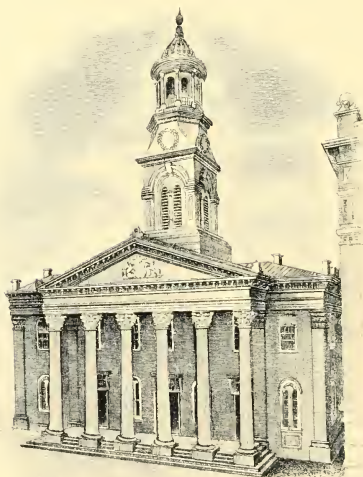
NEW COURT HOUSE.