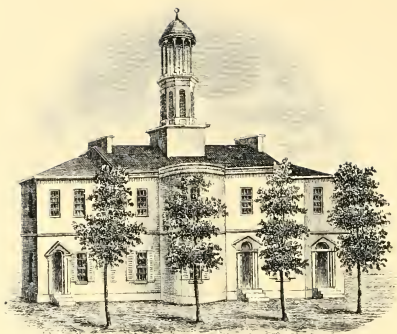
OLD COURT HOUSE.