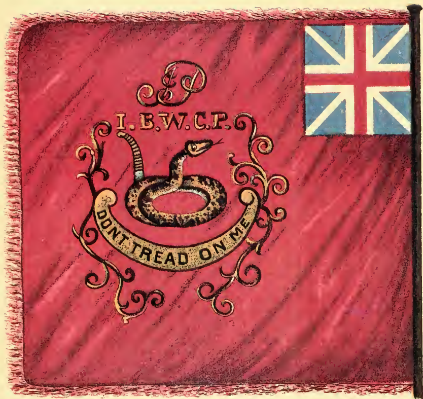
FLAG OF PROCTOR'S WESTMORELAND COUNTY BATTALION.