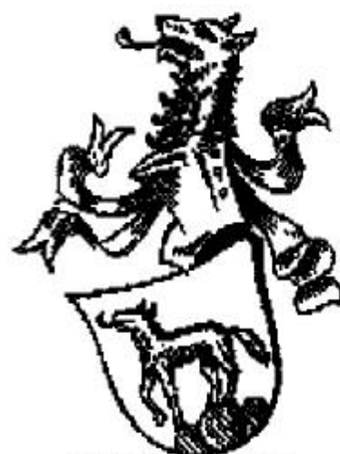
Wolfensberger coat of arms