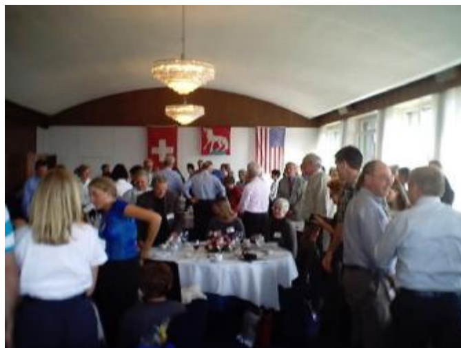
In the Hotel Schwanen in Rapperswil, small talk after lunch. So many new friends, but too short the time getting closer contact to our American friends. You see our family coat of arms between the Swiss and American flags.