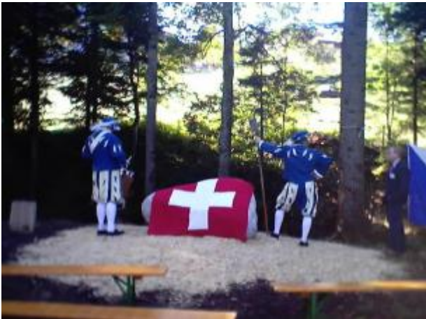
Th old soldiers waiting for our Wolfensberger families coming up the mountain, watching the memorial stone on the place where our castle stood, drumming in the forest. The monument stone veiled at the place our ancestors once