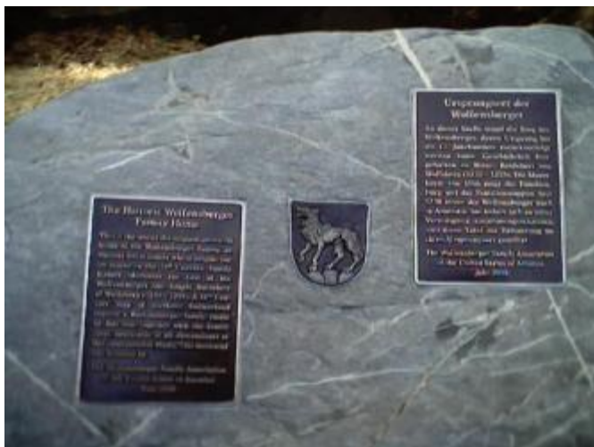
The memorial stone on the place where in medieval times our family castle stood. What a marvelous stone and super plaques. The inscriptions declaring the roots of our Wolfensberger family in English and German on each side of the coat of arms. A present from our American family members. Many thanks and God bless you.