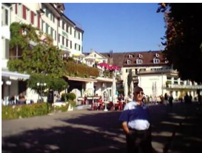
A marvelous day has finished. In front of the Hotel Schwanen our family members leaving the place where they learned in one day an unforgettable knowledge about our family structure and their persons. Rudolf Wolfensberger is shown in the foreground.