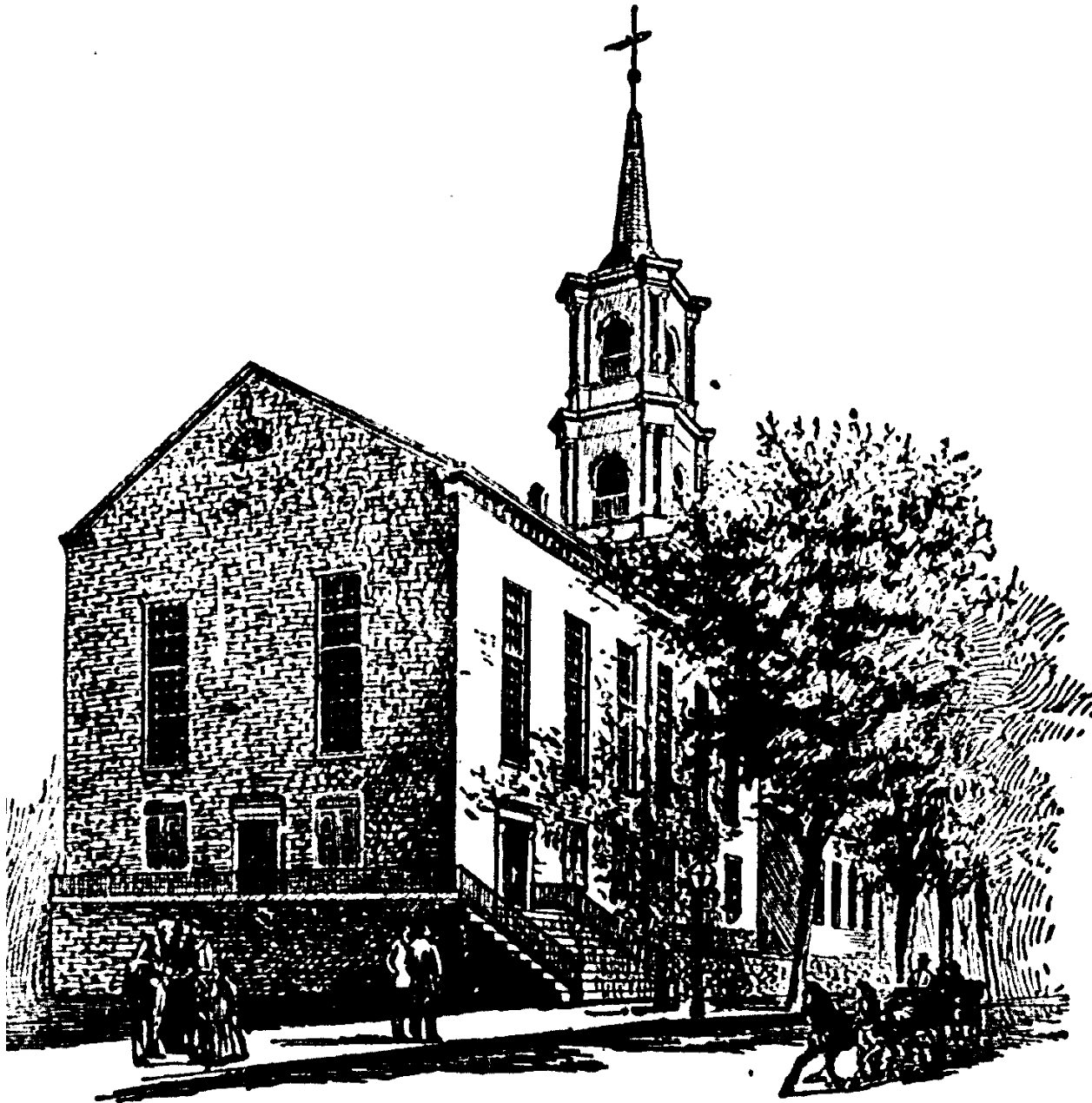
GABOR (First Reformed) CHURCH, LEBANON, PA. Corner-stone laid June, 26th, 1792. Dedicated May, 8th, 1795