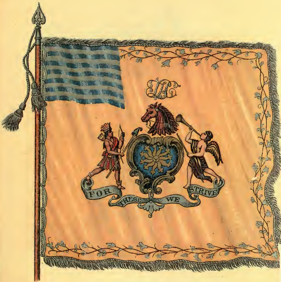
STANDARD OF PHILADELPHIA LIGHT HORSE, 1776.