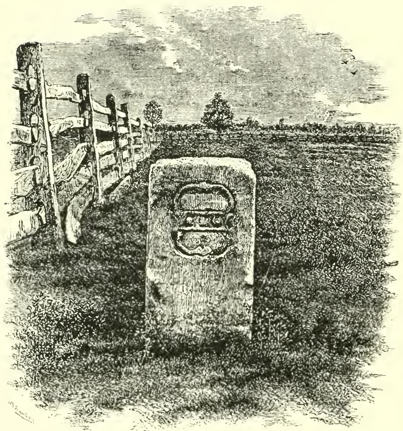
THE BOUNDARY STONE AT OXFORD, CHESTER COUNTY.