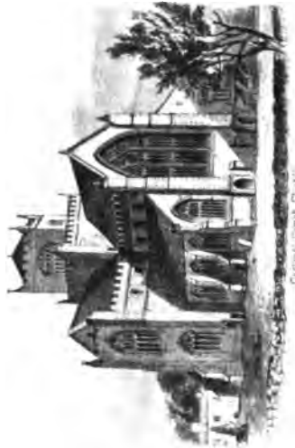
Cartmell Parish Church, England

The name CARTMELL is from Kert, a camp or fortification and mell a fell. It means "The fortress among the fells." The church dates back to 677, and Egfred, King of Northumberland, gave St. Cuthbert the land and all the Britons in it. A priory was founded in 1188, which was destroyed, but the site was regranted by Henry VIII. Cartmell township is 15 miles long and 4 or 5 wide, and indeed it is difficult to imagine that even Adam, in all the beauty of Paradise, looked upon a much fairer landscape than that which meets the eye, when from the summit of Hamps Fell, the Valley of Cartmell is seen lit up with the setting lustre of an autumn sun. In the south the sea, in the north the valley, in the east the Fell, in the west Howbarrow and tree-clad St. Bernard. The organ was erected in 1786. The stalls and choir are in Grecian style, surmounted by Corinthian capitals with sculptured heads. A grant of the rectory of Cartmell was made to Cuthbert a bishop of Chester, in the fourth or fifth year of the reign of Phillip and Mary, 1554.