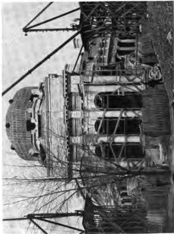
Handley Library, December 1908