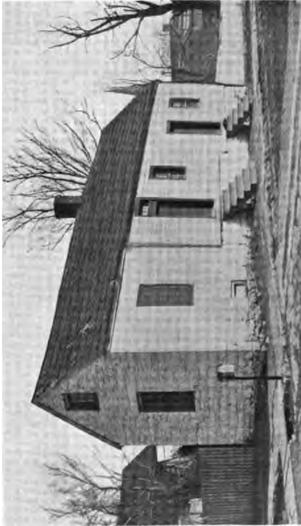
Washington's Headquarters, Winchester