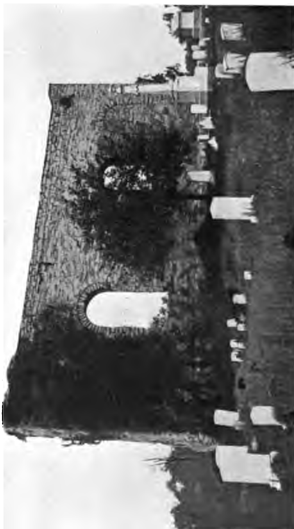
Ruins of old Lutheran Church, Winchester