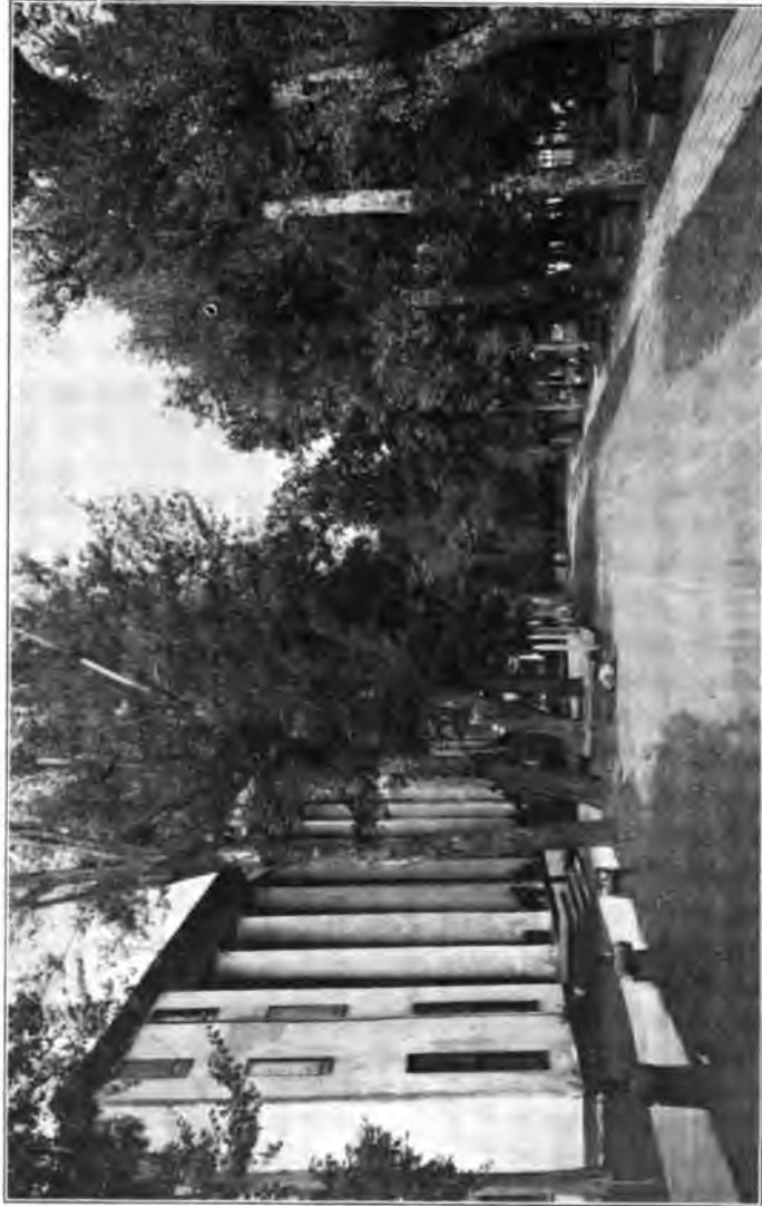
Mountain House, Capon Springs