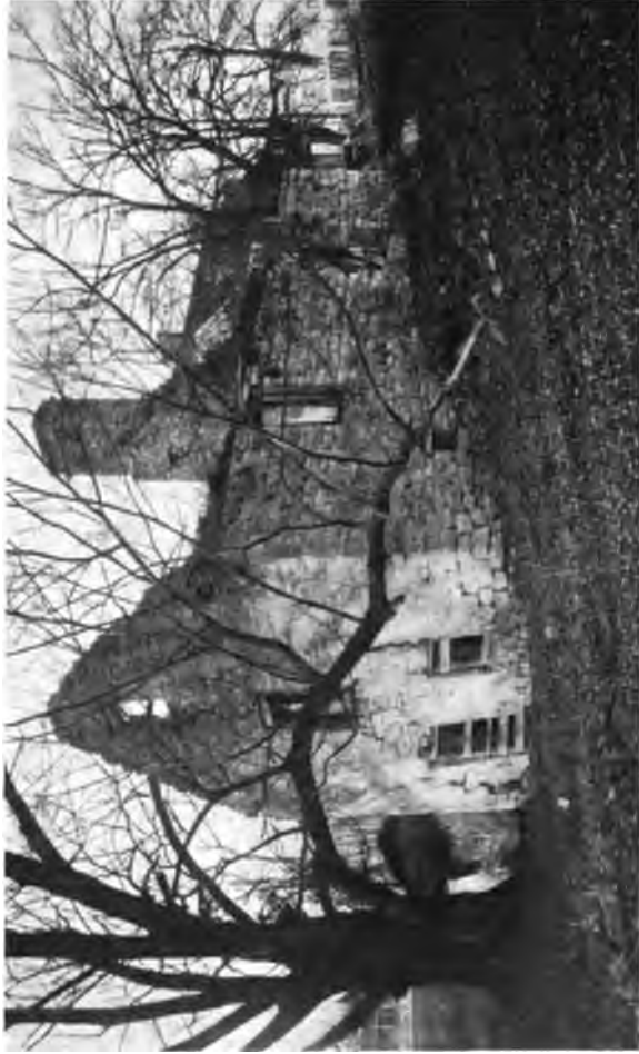
Old Joist Hite Fort, near Bartonsvill; erected 1750