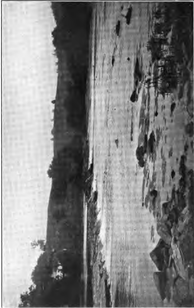
Pack Horse Ford, near Shepherdstown