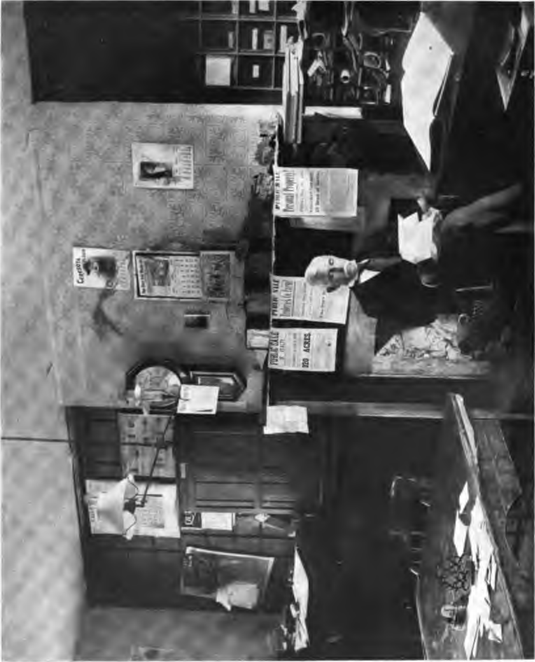
Interior of Frederick County Clerk's Office when first impression of the Washington Family seal was used