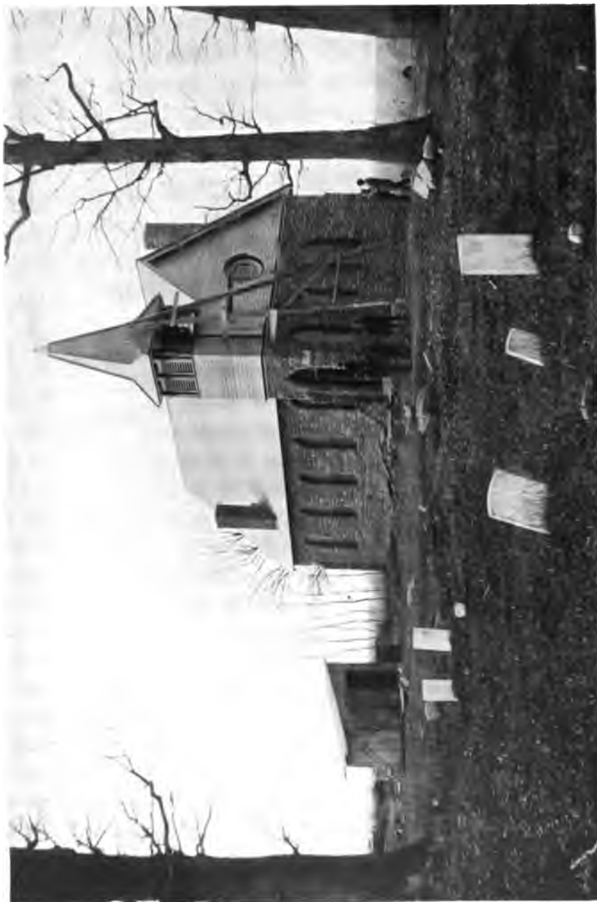
Opeckon Memorial Church