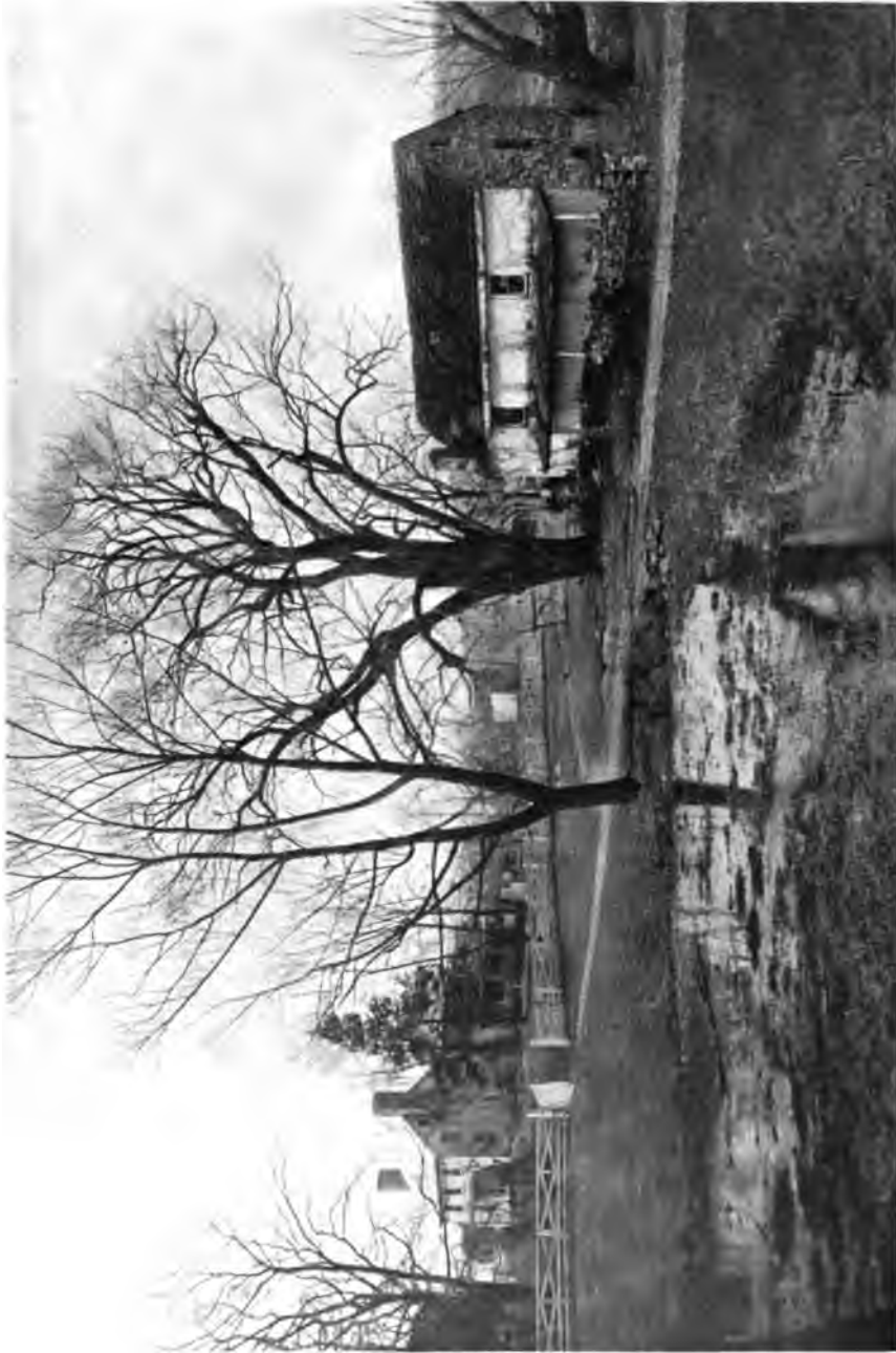
Greenwood Homestead, founded by Samuel Glass, 1738