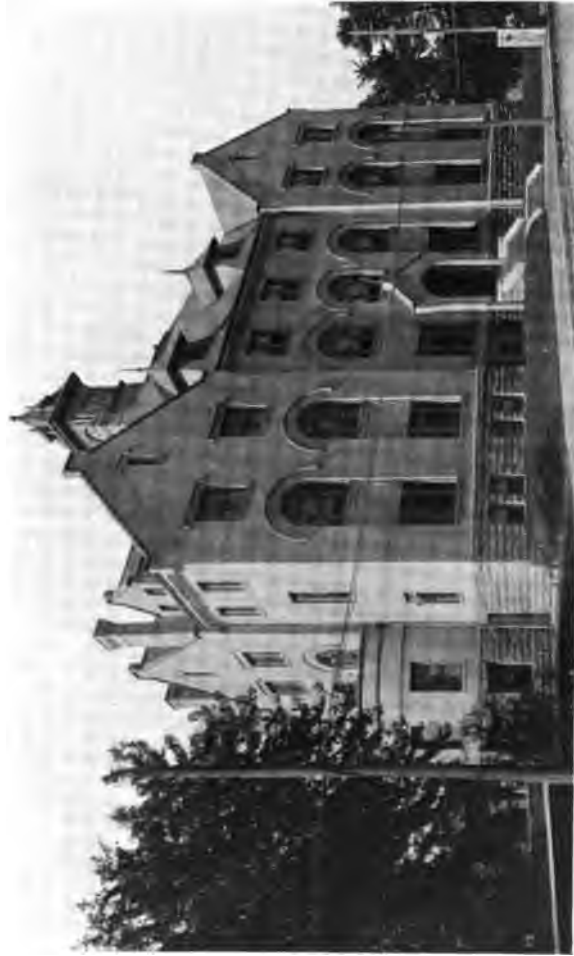
City Hall, Winchester, Va. (Market Street Entrance)