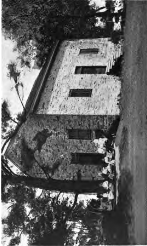
Old Chapel, near Millwood