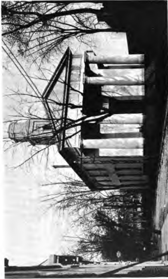
Frederick County Court House; erected in 1840