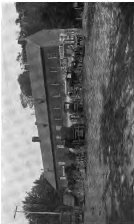
Old Market, Winchester, Va.